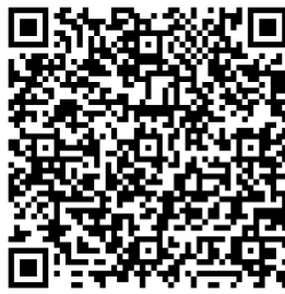
Google Play Store

3) Open the Digipass app and scan the Cronto Image displayed on the screen and enter the number displayed in the DEVICE CODE box. Choose a device nickname , pin number , and set up a security question and answer and click CONTINUE .